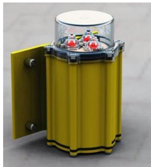
OBSlite Type B