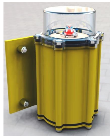
OBSlite Type A