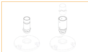
Figure 1 On FL-10 Flange