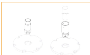
Figure 2 On FL-12 Flange